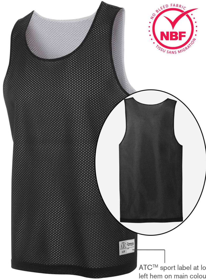
ATC™ sport label at lower left hem on main colour side