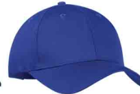
A Little Lighter Than 294C