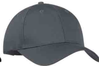
Cool Grey 11C