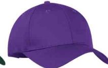
Deeper Than 7679C