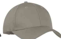
Cool Grey 8C