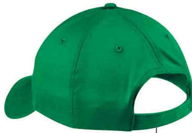
Adjustable hook and loop closure