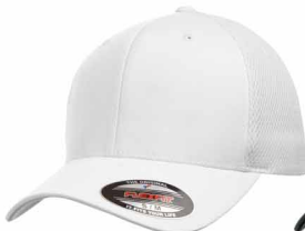
No PMS / No PMS