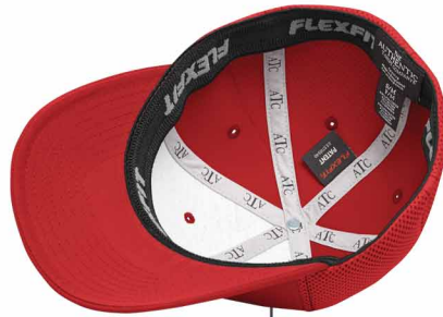
ATC™ taping on inside seams