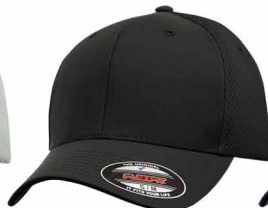
Black C / Black C