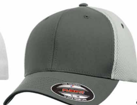
Little Darker Than 7540C / Little Lighter Than 427C