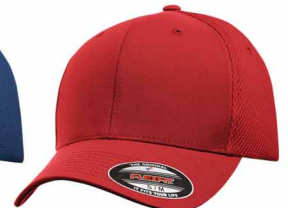
1935C / 1935C