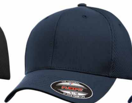
Between 534C & 533C / Between 534C & 533C