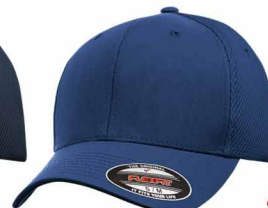
654C / 654C